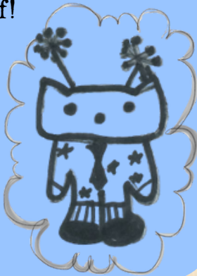
Illustration by Emily

We need your help! Can you find all 12 hidden around the Apothecary and Feastery, to help us stop the chaos!?